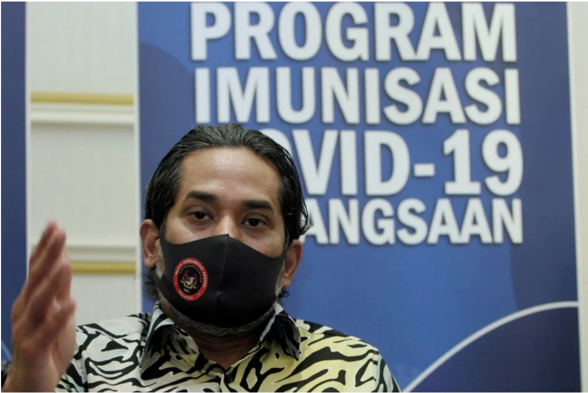
Science, Technology and Innovation Minister Khairy Jamaluddin said the ministry was in the midst of drafting the strategy and allocation for the PPVs under the third phase.

"Perak is the second state with the most number of people who have received the first dose of the vaccine after Selangor in the country.